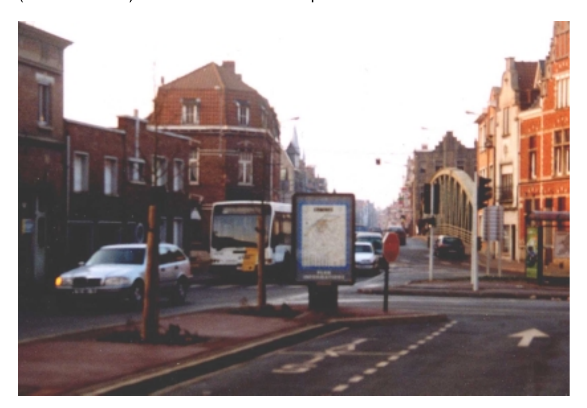
Figure 2: De Lijn (Flemish) bus arriving in Comines (France) on a service which has been extended one stop over the border. The bridge in the background is the border and beyond that is Comines/Komen (Belgium)

The Flemish operator De Lijn also extends a limited number of services into France: the leper (Ypres) to Comines bus service (2-hourly) and the leper – Mouscron service which diverts at Menen into Halluin (France) twice a day for school traffic. One of these services is shown in Figure 2, which also illustrates the built-up nature of the border area – in fact in some areas it is easy to cross the border without noticing immediately, as signs are discrete (or non-existent) and there are no border posts.