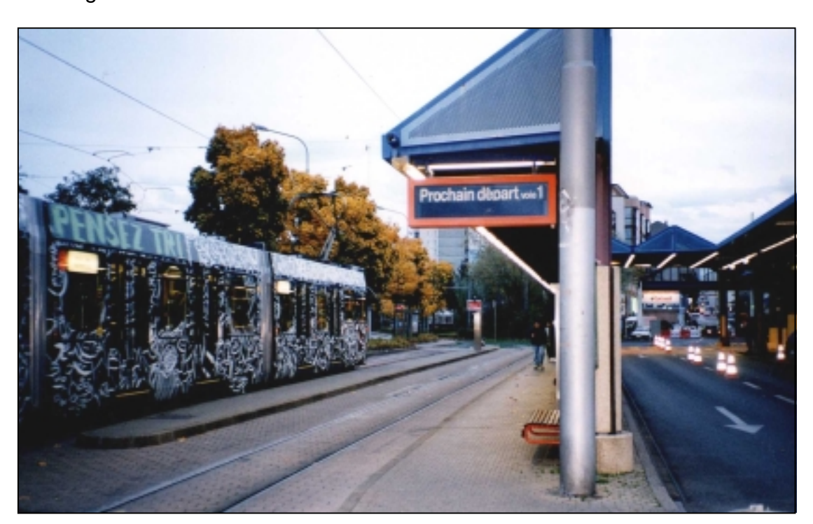
Figure 4: Geneva tram terminus at the border with Annemasse. Passengers must walk through the customs post (background, right hand side) to connect with buses on the French side

Buses and trams in Geneva are operated by TPG (Transports Publics Genevois). The tram network extends to the French border near Annemasse, where it terminates and passengers must then walk about 200 metres across the border and interchange with the local bus services in Annemasse (see Figure 4). Although this interchange is relatively easy, there is of course a time penalty and also the bus service on the French side finishes earlier in the evening than the trams on the Swiss side.